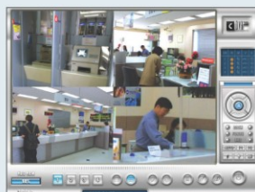
CDVR 200 Live mode