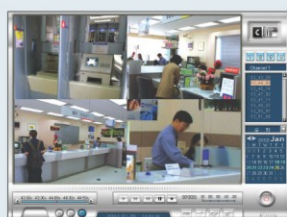
CDVR 200 Search mode